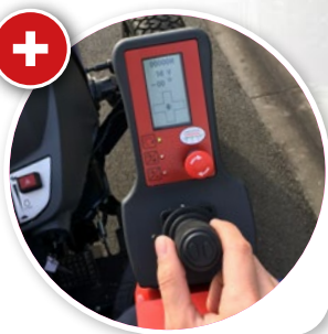
Proportional electric central with visualisation screen.